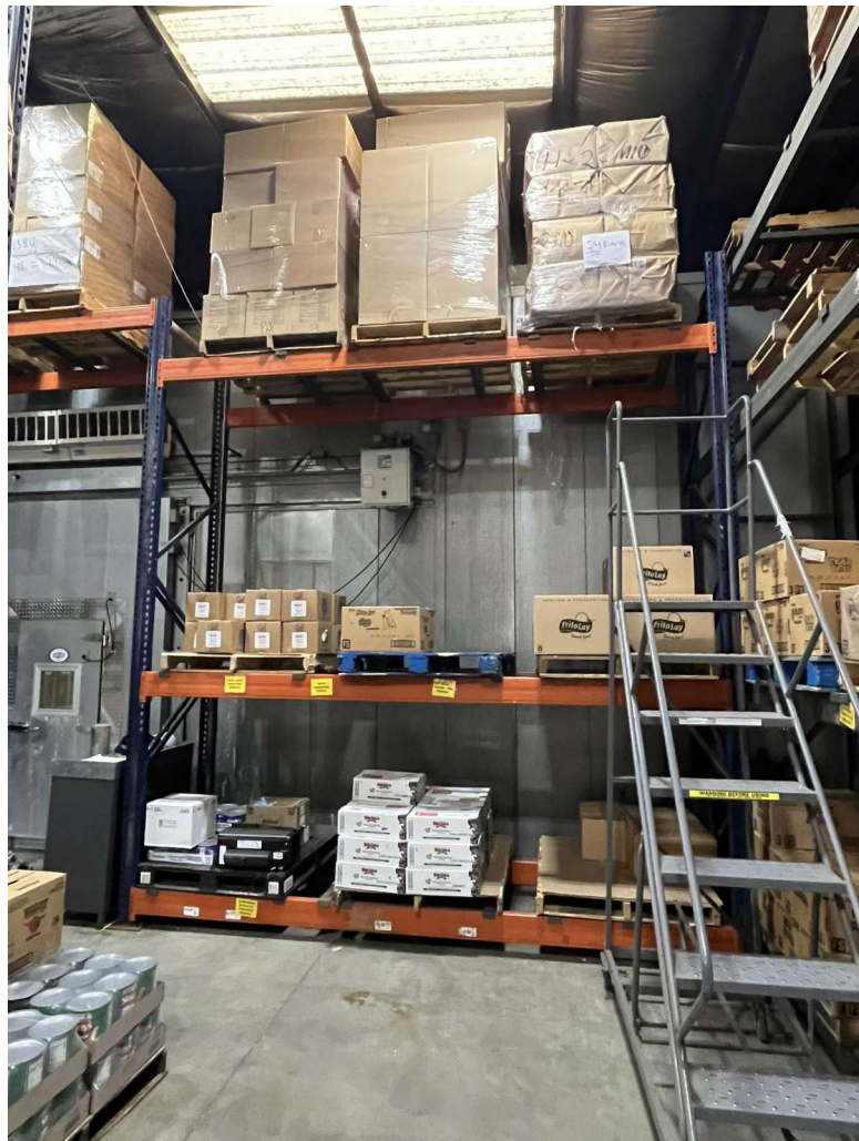
EXISTING FREEZER AND WAREHOUSE STORAGE TAKEN 03/12/25

4. PUBLIC TELEPHONES THERE ARE NO PUBLIC PAY OR PUBLIC COURTESY TELEPHONES PROVIDED ON SITE. THE WAREHOUSE HAS AN OFFICE TELEPHONE FOR RECEIVING. 5. DRINKING FOUNTAINS THERE IS NO DRINKING FOUNTAIN PROVIDED AT THE WAREHOUSE. THE WAREHOUSE HAS A BOTTLE FILLER THAT IS PROVIDED AT AN ACCESSIBLE HEIGHT. THE BOTTLE FILLER WOULD NEED TO BE REMOVED AND REPLACED WITH A DRINKING FOUNTAIN/BOTTLE FILLER COMBO AT AN ACCESSIBLE HEIGHT.