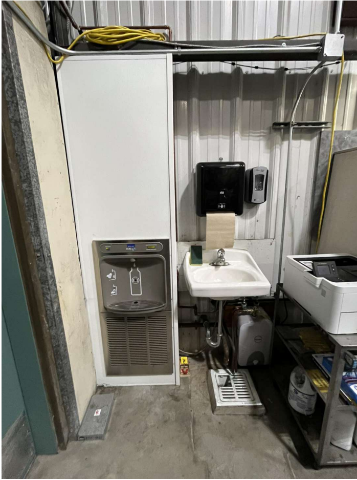
EXISTING WATER BOTTLE FILLER IN WAREHOUSE - A CODE COMPLIANT DRINKING FOUNTAIN AND BOTTLE FILLER TO BE INSTALLED TAKEN 03/12/25

4. PUBLIC TELEPHONES THERE ARE NO PUBLIC PAY OR PUBLIC COURTESY TELEPHONES PROVIDED ON SITE. THE WAREHOUSE HAS AN OFFICE TELEPHONE FOR RECEIVING. 5. DRINKING FOUNTAINS THERE IS NO DRINKING FOUNTAIN PROVIDED AT THE WAREHOUSE. THE WAREHOUSE HAS A BOTTLE FILLER THAT IS PROVIDED AT AN ACCESSIBLE HEIGHT. THE BOTTLE FILLER WOULD NEED TO BE REMOVED AND REPLACED WITH A DRINKING FOUNTAIN/BOTTLE FILLER COMBO AT AN ACCESSIBLE HEIGHT.