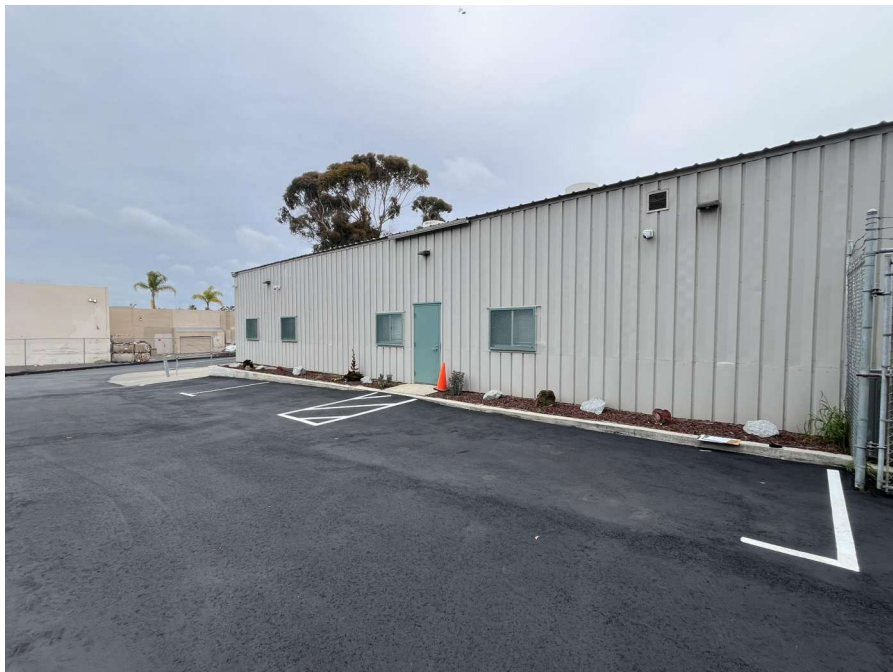
ENTRANCE TO LOWER OFFICE BUILDING - CURRENTLY THERE ARE NO ACCESSIBLE PARKING IN FRONT OF THE OFFICE BUILDING - ASPHALT WILL NEED TO BE MODIFIED TO PROVIDE LEVEL PARKING AND AISLE TAKEN 03/12/25

6. PARKING PARKING IS PROVIDED IN FRONT OF THE OFFICE BUILDING WITHOUT ANY ACCESSIBLE STALLS. THE AREA IN FRONT OF THE OFFICE WILL NEED TO BE RE-GRADED TO PROVIDE A LEVEL ACCESSIBLE VAN STALL WITH ACCESS AISLE TO CONNECT TO THE NEW RAMP.