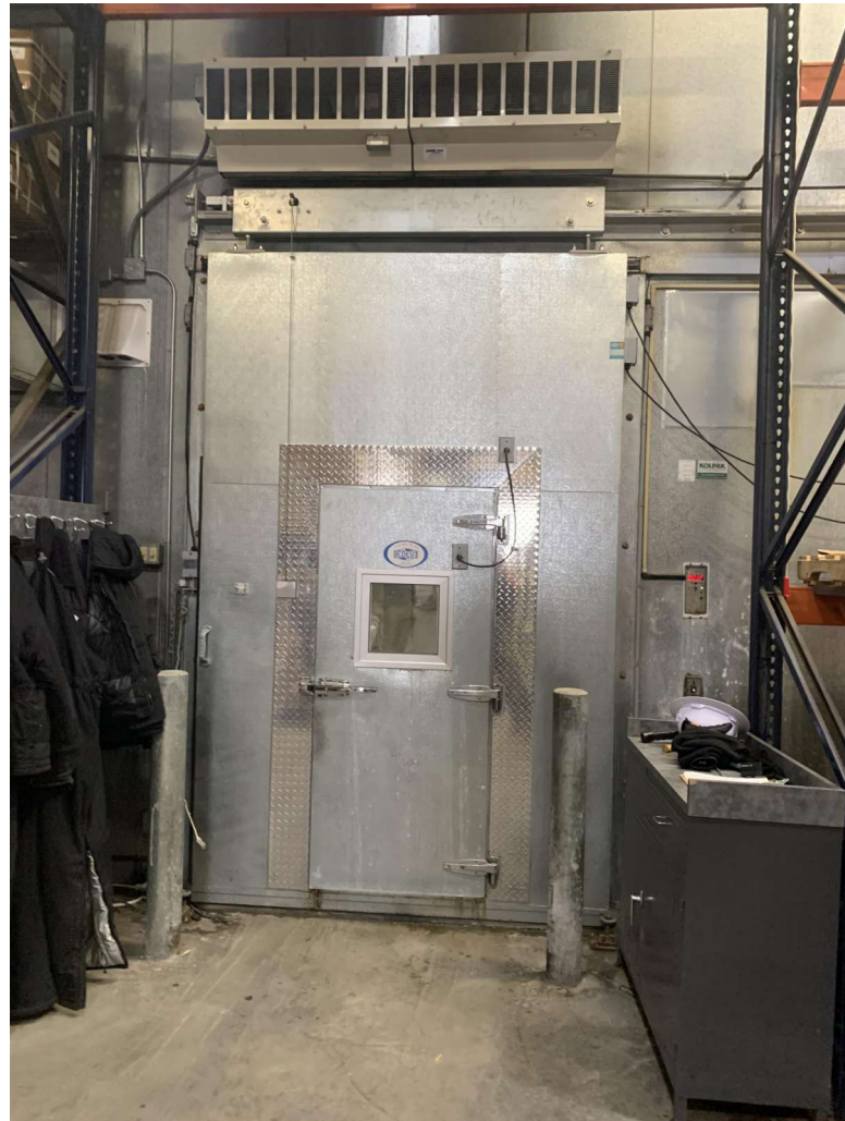
EXISTING FREEZER ENTRANCE TAKEN 03/12/25