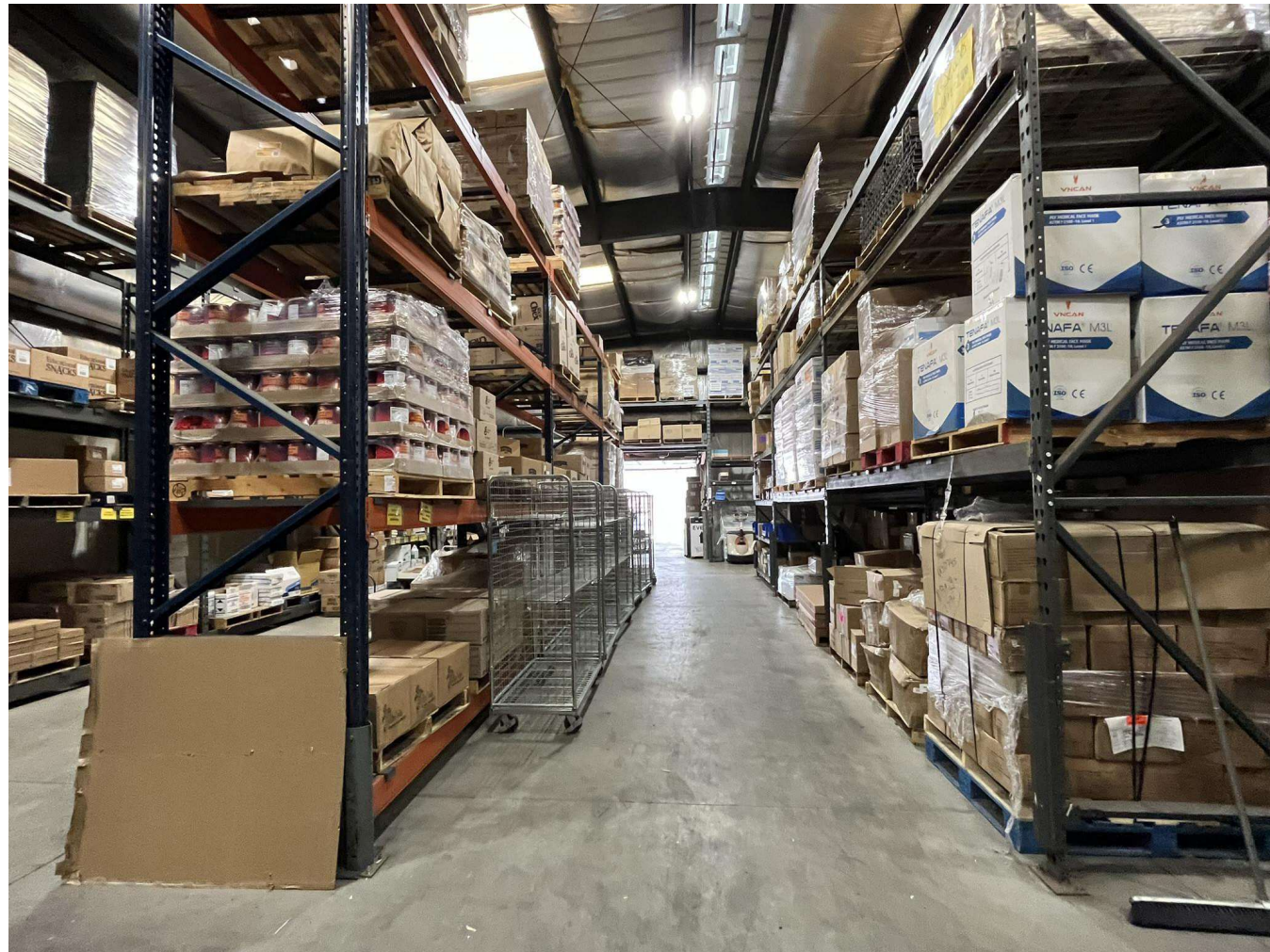
INTERIOR OF WAREHOUSE LOOKING OUT TOWARDS DOCK TAKEN 03/12/25