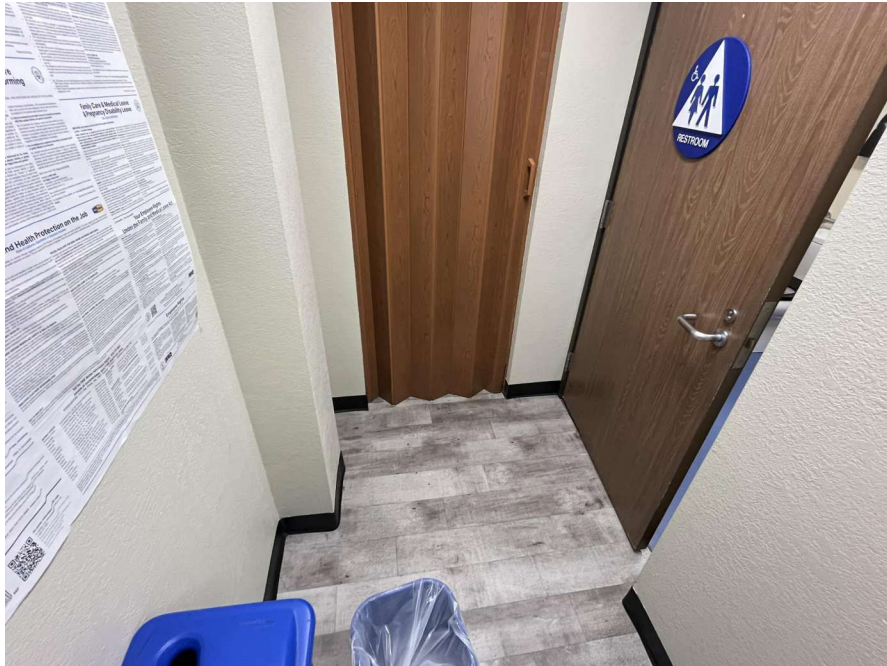
EXISTING RESTROOM DOOR ENTRANCE - DOOR SWING TO BE MODIFIED TO SWING IN - WALL POP OUT IN CORRIDOR TO BE REMOVED - DOOR IS MISSING CODE REQUIRED ROOM ID SIGNAGE TAKEN 03/12/25

3. AT LEAST ONE RESTROOM FOR EACH GENDER OR ALL-GENDER RESTROOM FOR EACH USER GROUP THERE ARE NO EXISTING RESTROOMS IN THE WAREHOUSE, BUT THERE ARE TWO EXISTING RESTROOMS IN THE OFFICE BUILDING. BY INSTALLING THE NEW RAMP TO CONNECT THE WAREHOUSE TO THE OFFICE BUILDING, ONE OF THE EXISTING RESTROOMS CAN BE MODIFIED TO MEET CURRENT CODE REQUIREMENTS. THIS INCLUDES REMOVING THE CURRENT LAVATORY AND RE-LOCATING IT TO THE SIDE WALL SO THAT IT DOES NOT IMPEDE INTO THE WATER CLOSET CLEARANCE AND REINSTALLING GRAB BARS, SOAP DISPENSER, MIRROR AND OTHER ACCESSORIES TO MEET CODE. THE EXISTING WATER CLOSET IS CURRENTLY COMPLIANT. THE EXISTING DOOR WILL NEED TO BE MODIFIED TO SWING INTO THE RESTROOM INSTEAD OF OUT. AN EXISTING WALL POP OUT IN THE CORRIDOR WILL NEED TO BE REMOVED.