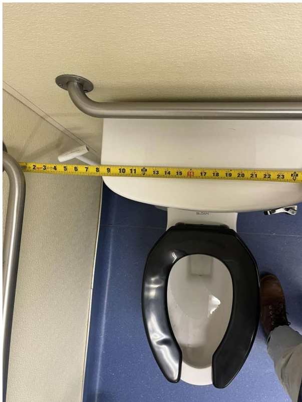
EXISTING WATER CLOSET LOCATION TAKEN 03/12/25