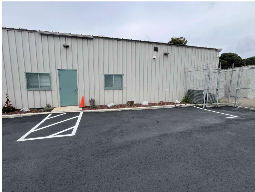
ENTRANCE TO LOWER OFFICE BUILDING - CURRENTLY THERE ARE NO ACCESSIBLE PARKING IN FRONT OF THE OFFICE BUILDING - ASPHALT WILL NEED TO BE MODIFIED TO PROVIDE LEVEL PARKING AND AISLE TAKEN 03/12/25

7. SIGNS DOORS CURRENTLY DO NOT HAVE CODE COMPLIANT SIGNS. EACH DOOR ALONG THE PATH OF TRAVEL WILL REQUIRE CODE COMPLIANT BRAILLE FOR IDENTIFYING, AND ACCESSIBLE SYMBOL AND EXIT SIGNAGE WHERE APPLICABLE - REFER TO IMAGES OF DOORS IN PHOTOS.