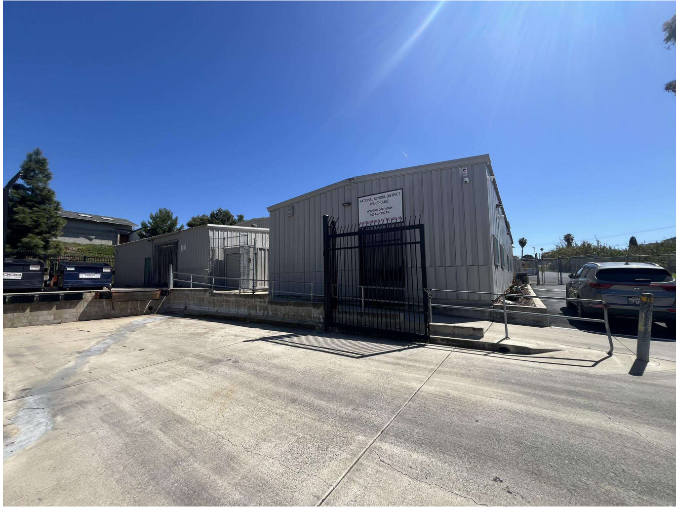
EXISTING RAMP UP TO WAREHOUSE AND DOCK - BREEZEWAY ENTRANCE BETWEEN OFFICE AND WAREHOUSE TAKEN 03/19/25