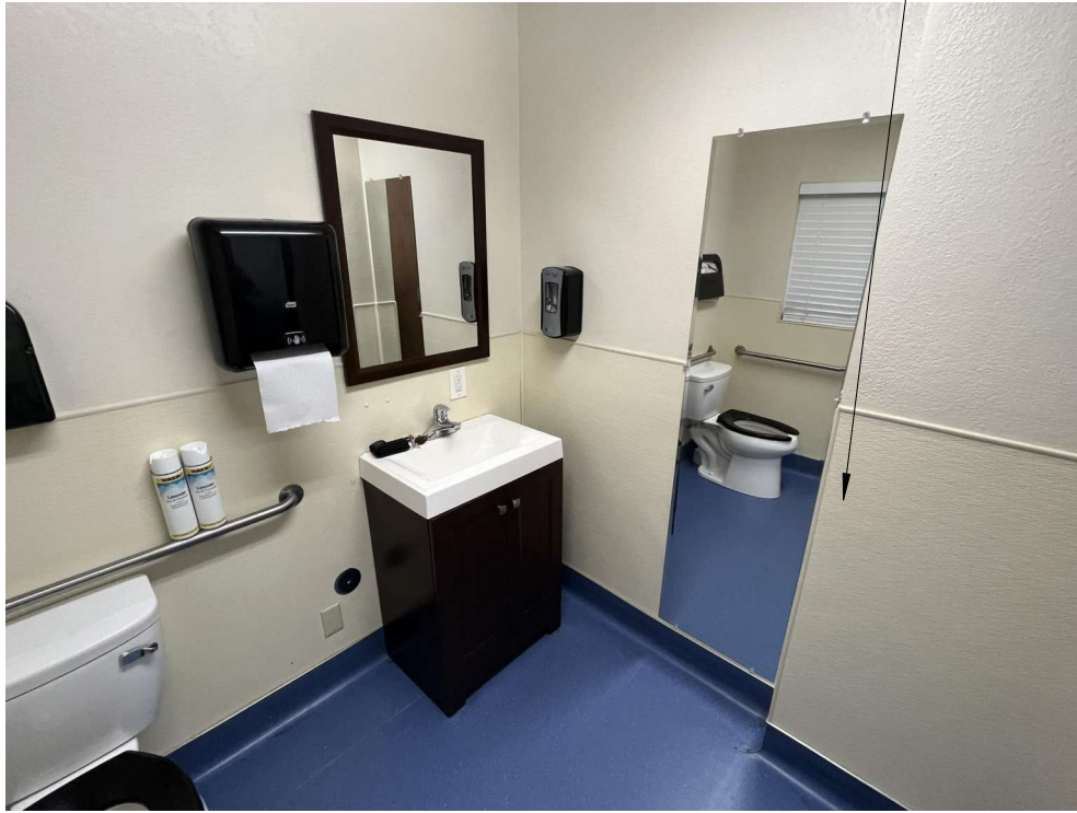
EXISTING RESTROOM - LAVATORY IMPEDES INTO THE WATER CLOSET CLEAR FLOOR SPACE AND WILL NEED TO BE REINSTALLED AT SIDE WALL. RESTROOM ACCESSORIES WILL NEED TO BE REINSTALLED TO MEET CODE DIMENSIONS. WATER CLOSET LOCATION IS COMPLIANT. TAKEN 03/12/25