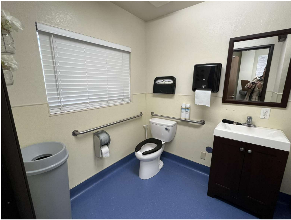
EXISTING RESTROOM - LAVATORY IMPEDES INTO THE WATER CLOSET CLEAR FLOOR SPACE AND WILL NEED TO MOVE TO SIDE WALL. RESTROOM ACCESSORIES WILL NEED TO BE REINSTALLED TO MEET CODE DIMENSIONS. WATER CLOSET LOCATION IS COMPLIANT. TAKEN 03/12/25