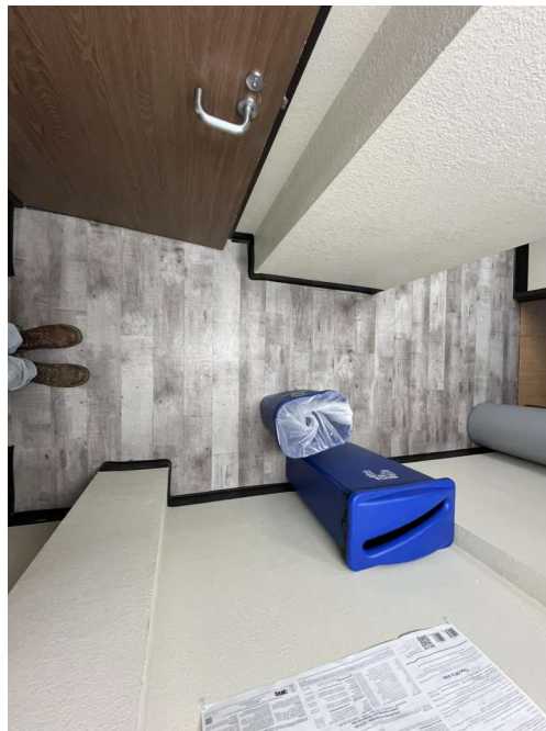
EXISTING RESTROOM DOOR ENTRANCE - DOOR SWING TO BE MODIFIED TO SWING IN - WALL POP OUT IN CORRIDOR TO BE REMOVED TAKEN 03/12/25